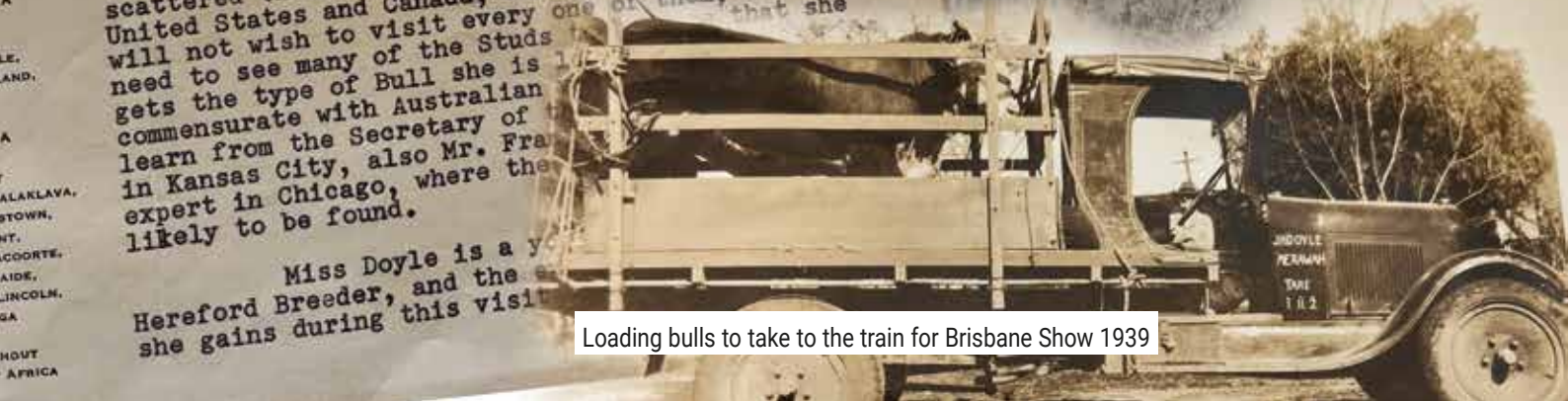
Loading bulls to take to the train for Brisbane Show 1939