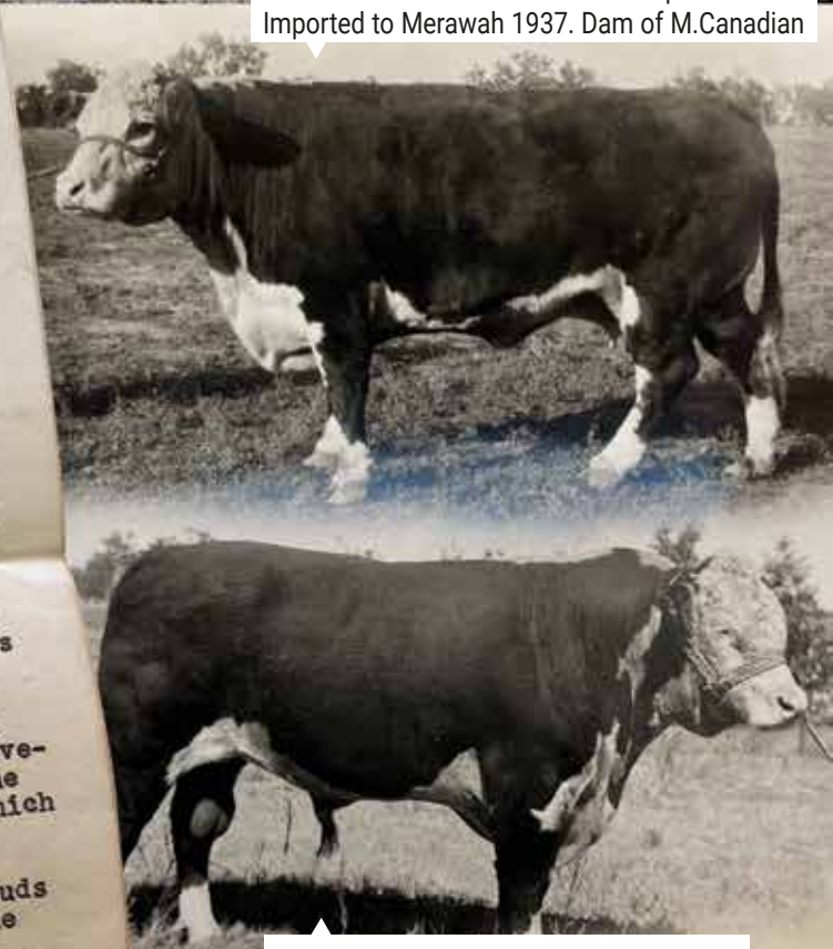
Belle Canadian US National champion 1936 Imported to Merawah 1937. Dam of M.Canadian