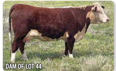
DAM OF LOT 44