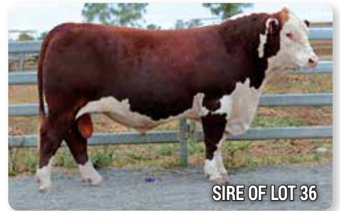
SIRE OF LOT 36