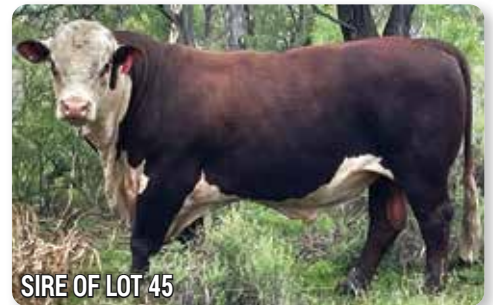
SIRE OF LOT 45