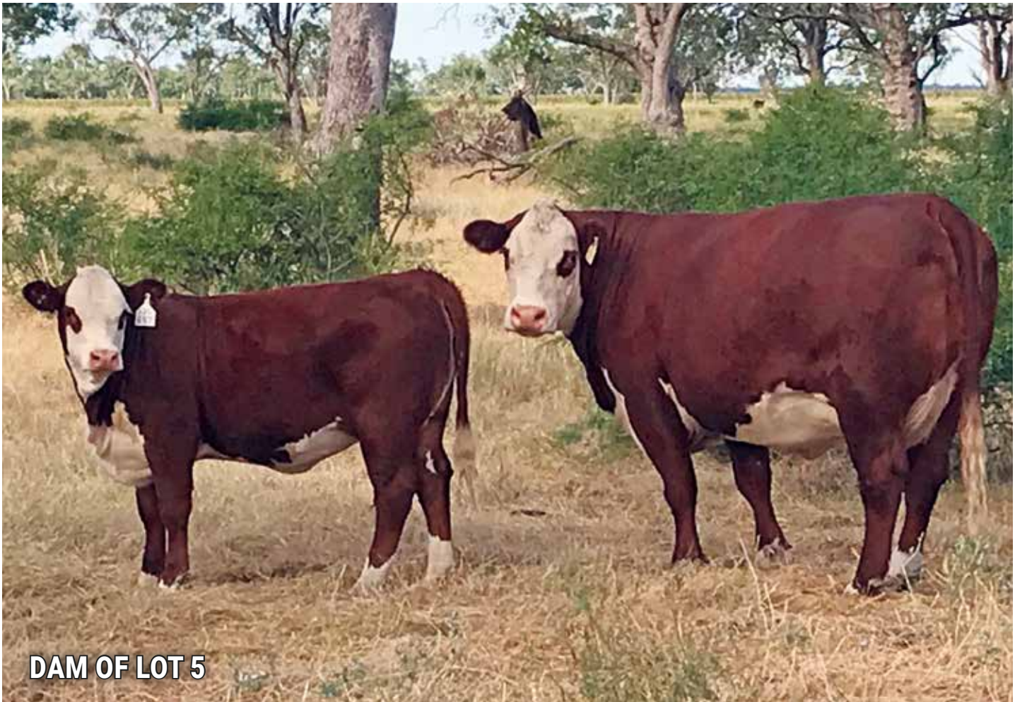
DAM OF LOT 5