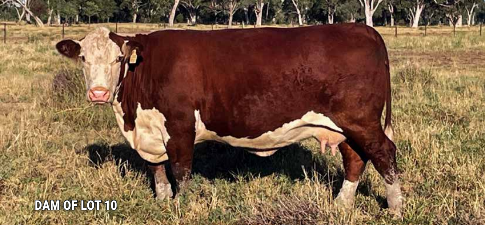
DAM OF LOT 10