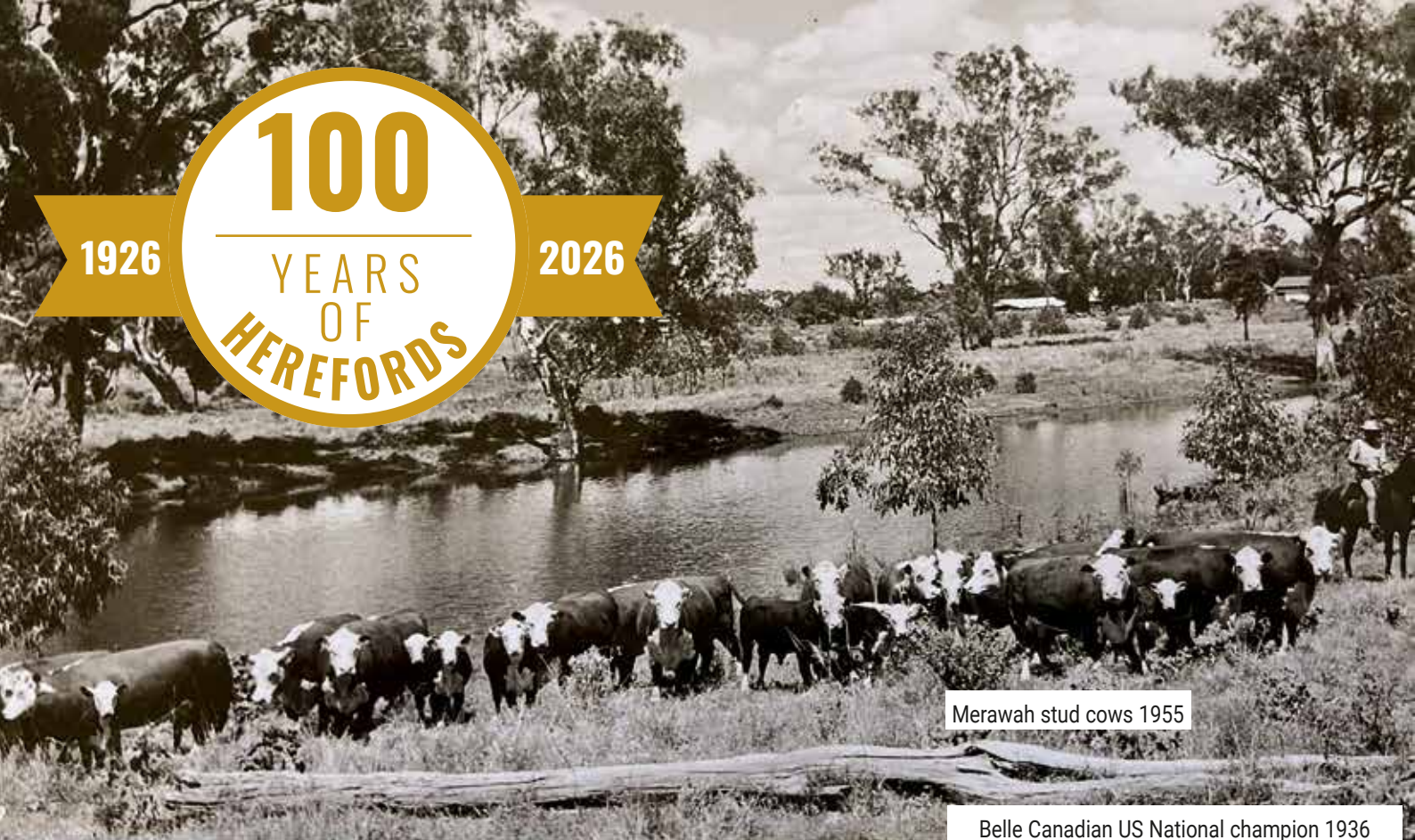
Merawah stud cows 1955

ALGETY AND COMPANY LIMITED (INCORPORATED IN ENGLAND) 15 BENT STREET SYDNEY 28th August, 1951.