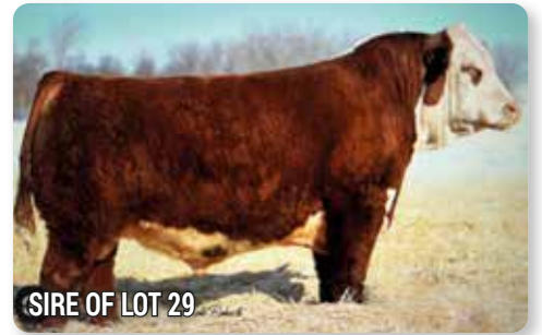
SIRE OF LOT 29