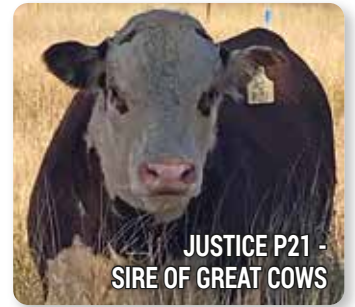
JUSTICE P21 - SIRE OF GREAT COWS