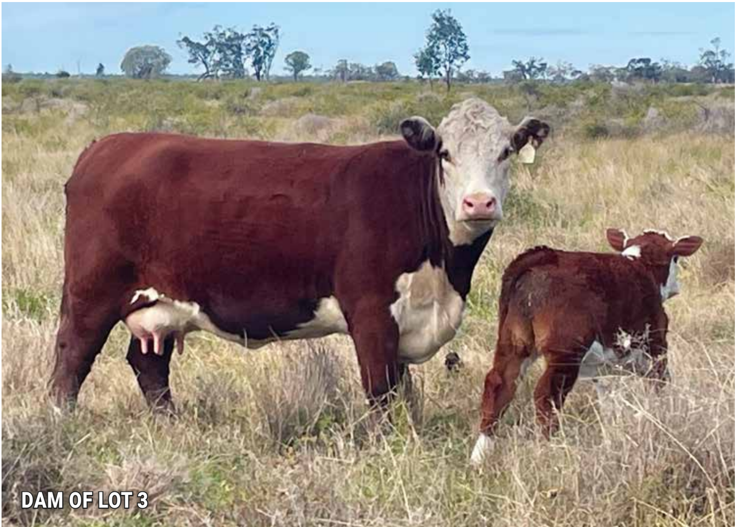
DAM OF LOT 3