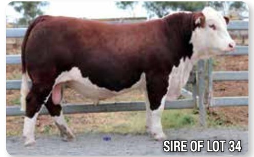
SIRE OF LOT 34