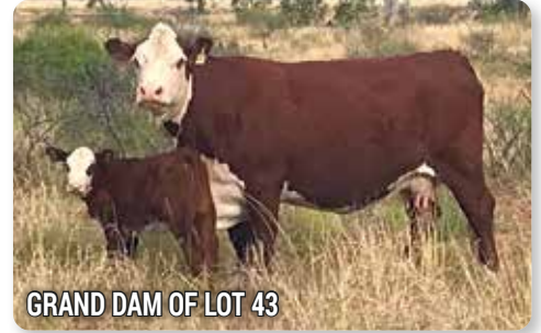
GRAND DAM OF LOT 43