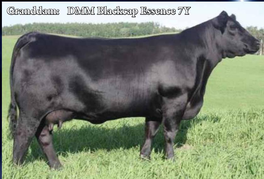
Granddam: DMM Blackcap Essence 7Y

V56 is a beautifully fronted, thick, soft and easy doing heifer with tremendous eye appeal. She is out of our prolific donor Q27 who consistently produces quality bulls and females, by DMM International 54D. We have retained numerous full sisters in our herd and they are performing well with beautiful udders. Her full sisters have been among our top priced females in previous sales. An ET sister sells as Lot 22.