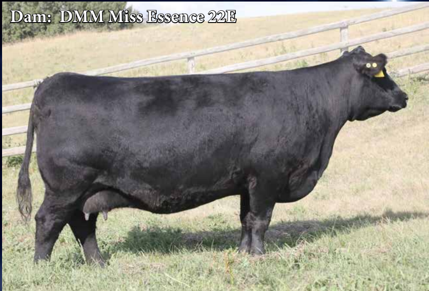
Dam: DMM Miss Essence 22E

V44 is an imported embryo from Miller Wilson in Canada sired by SAV Bloodline out of 22E, a beautifully uddered daughter of the great DMM Miss Essence 61W, one of MW's foundation females. This heifer is soft, deep sided and feminine.