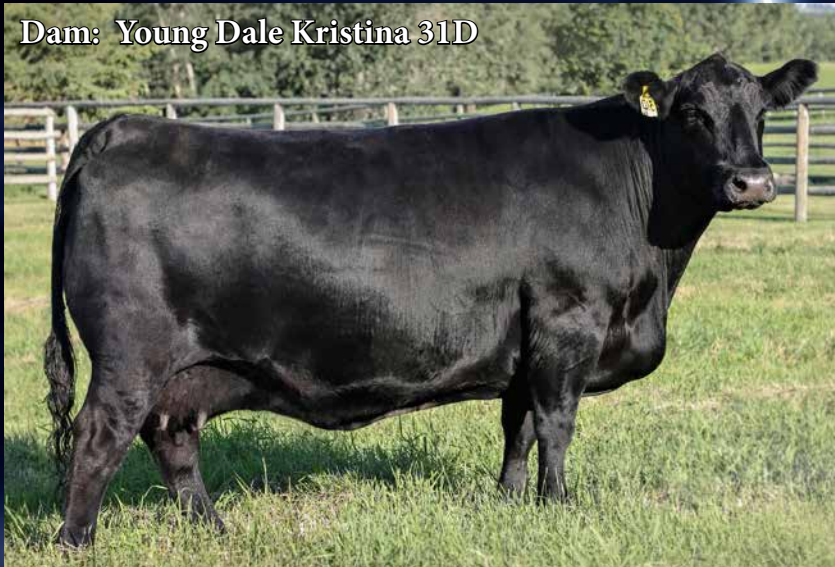
Dam: Young Dale Kristina 31D