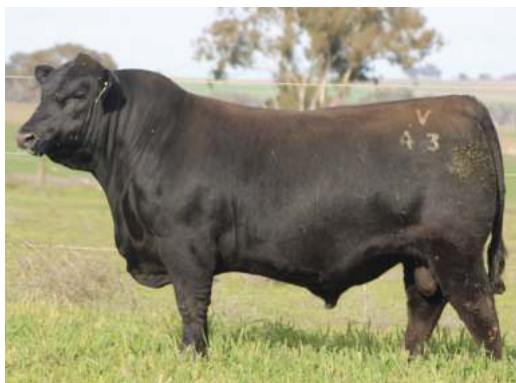
LOT 3 HOBBS LIVESTOCK STUNNER P140 V43