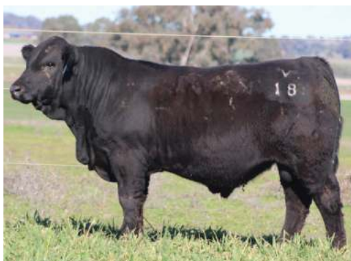
LOT 38 HOBBS LIVESTOCK 18 VEGAS PARTY