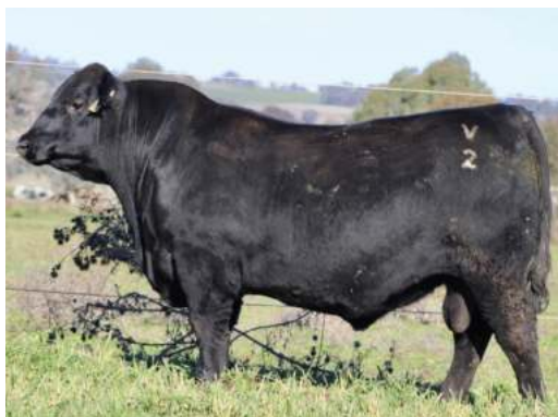
LOT 4 HOBBS LIVESTOCK TRUE NORTH P140 V2