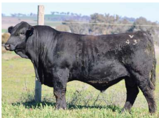
LOT 15 HOBBS LIVESTOCK P5 RIDDER V43