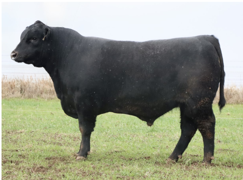
Mid June 2025 Trans Tasman Angus Cattle Evaluation