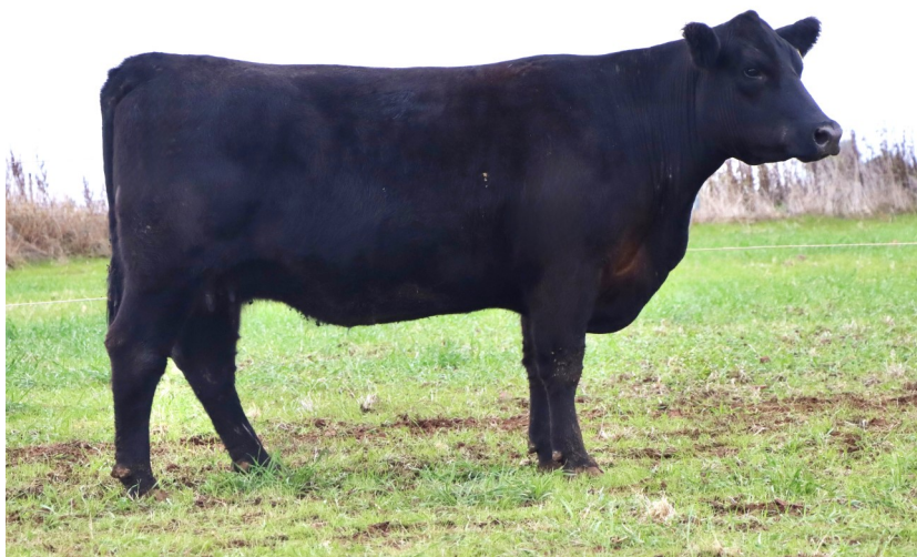
Mid June 2025 Trans Tasman Angus Cattle Evaluation