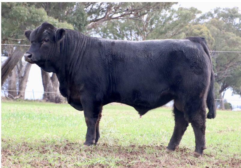
June 2025 Southern Limousin Single-Step Breedplan

Wulfs Zane X238Z Eltham Meadowgrass M6 Summit Meadowgrass 2149 H39