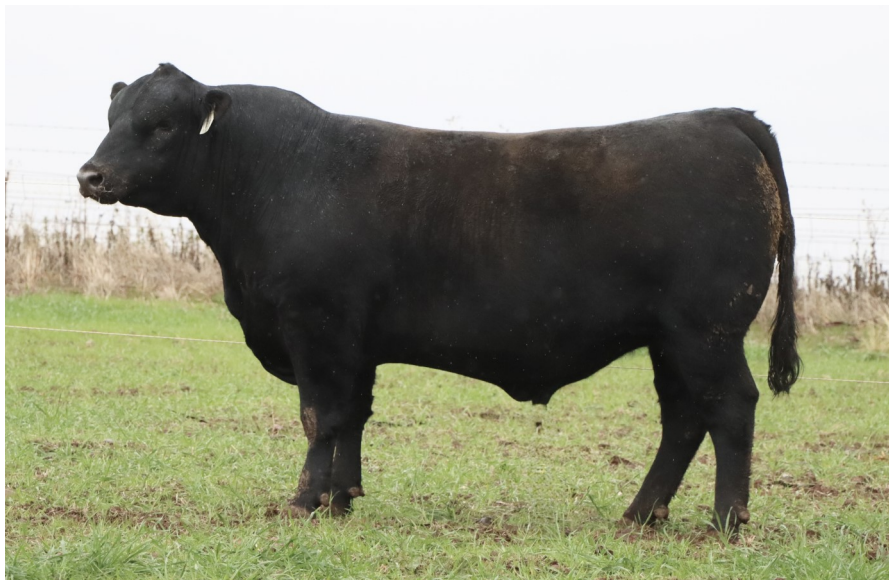
Mid June 2025 Trans Tasman Angus Cattle Evaluation