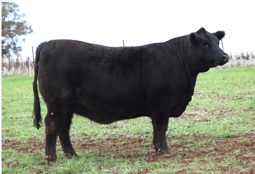
Mid June 2025 Trans Tasman Angus Cattle Evaluation