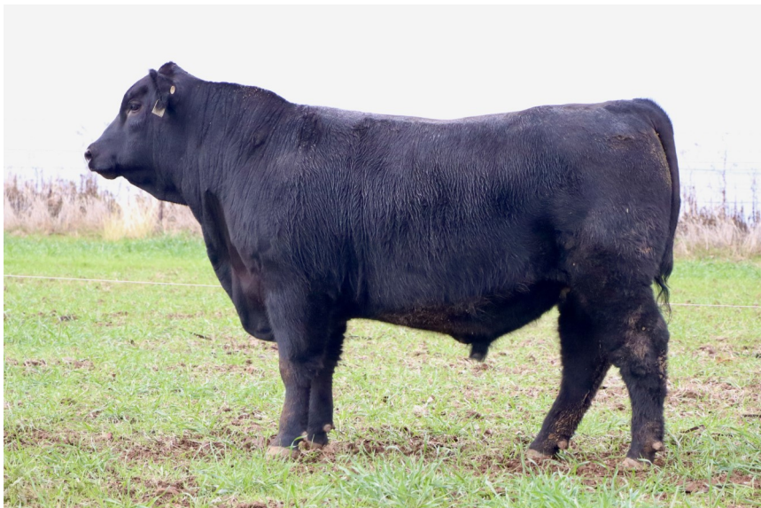
Mid June 2025 Trans Tasman Angus Cattle Evaluation