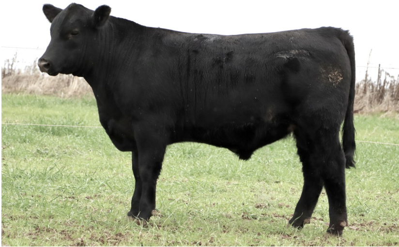
Mid June 2025 Trans Tasman Angus Cattle Evaluation

Righttime Varsity V10 Tuwharetoa Regent D145 Kenny's Creek Bara L407 Kenny's Creek Bara D147