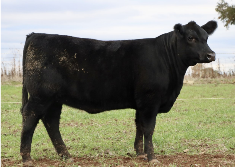
Mid June 2025 Trans Tasman Angus Cattle Evaluation

Tuwharetoa Regent D145 Kenny's Creek Bara L407 Kenny's Creek Bara D147