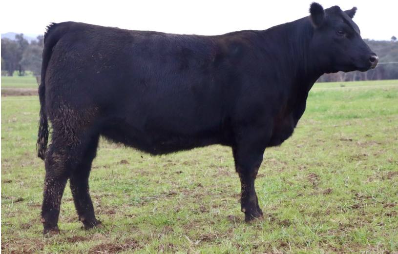
Mid June 2025 Trans Tasman Angus Cattle Evaluation

Poss Maverick Texas Iceman R725 Texas Undine H647 Hindmarsh Iceman June V5186 Gumbo Gulch Creed 94S Hindmarsh June T2 Black Diamond Ms Australia D301