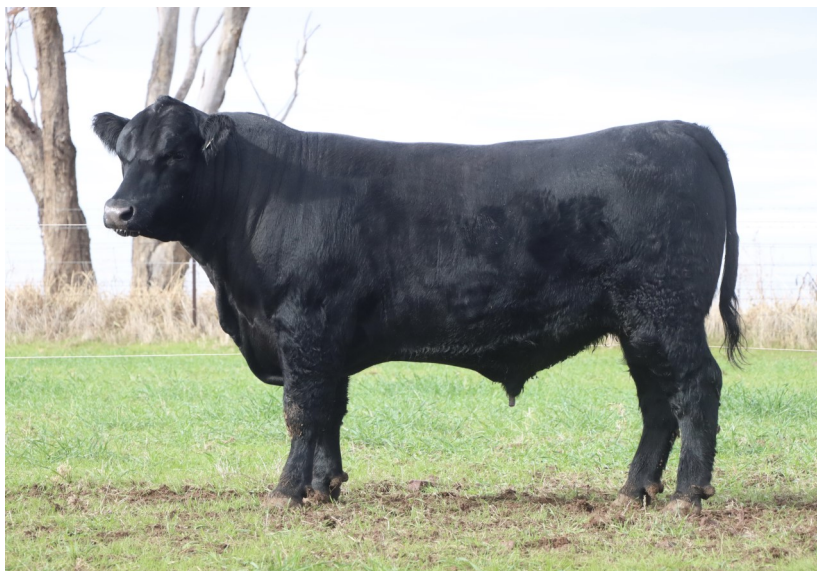
Mid June 2025 Trans Tasman Angus Cattle Evaluation