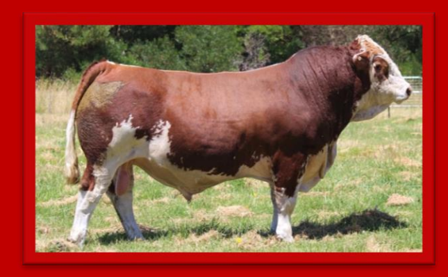
Woonallee Secret Service