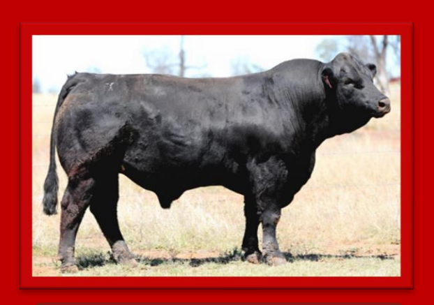
Yerwal Est Q300