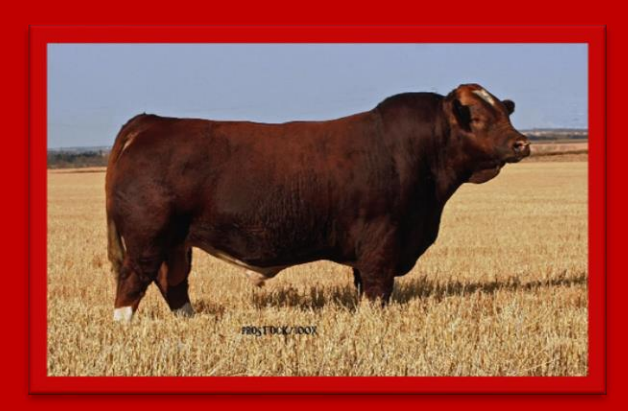
Rugged R Cavill