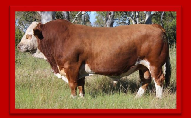
Grangeburn Masters Pride