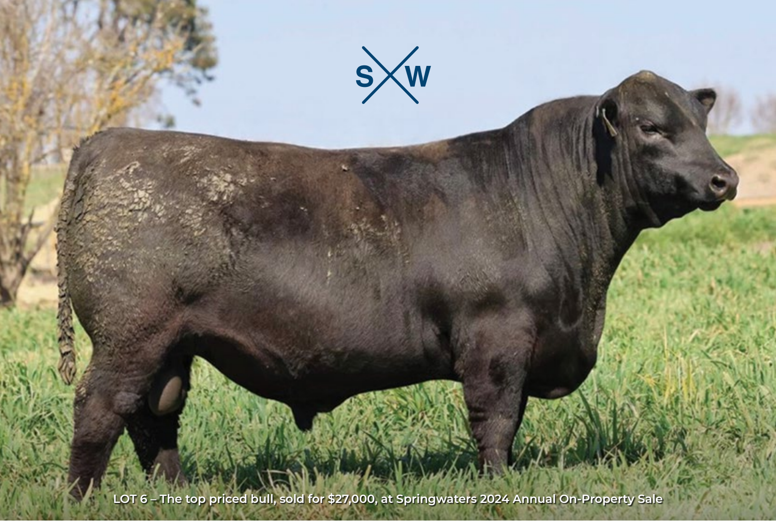
LOT 6 – The top priced bull, sold for $27,000, at Springwaters 2024 Annual On-Property Sale