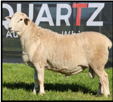
LOT 1 TAG:23-0023