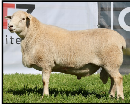
LOT 5 TAG:23-0014