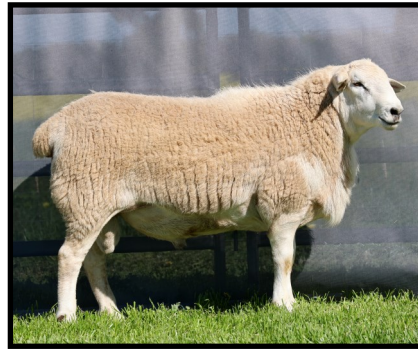
LOT 11 TAG:23-0001