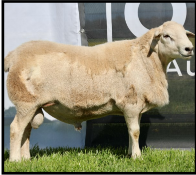
LOT 2 TAG:23-0004