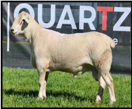
LOT 6 TAG:23-0019