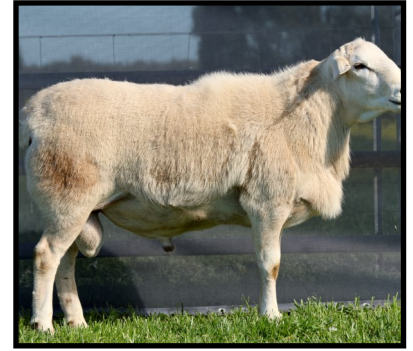
LOT 4 TAG:23-0003