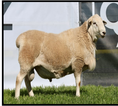
LOT 8 TAG:23-0015