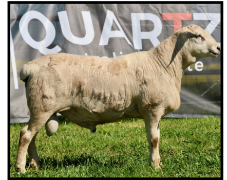
LOT 31 TAG:23-0113