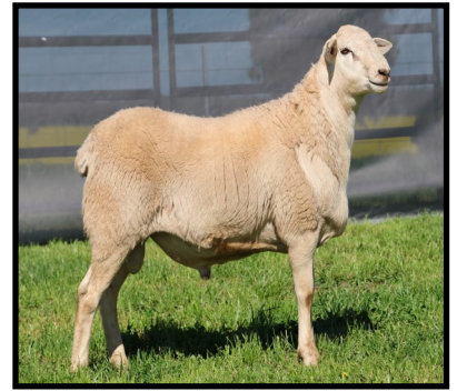
LOT 51 TAG:23-0141