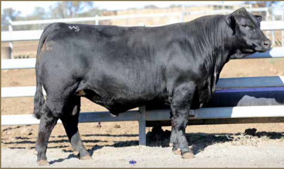
LOT 11 - WOONALLEE RENDEZVOUS T687