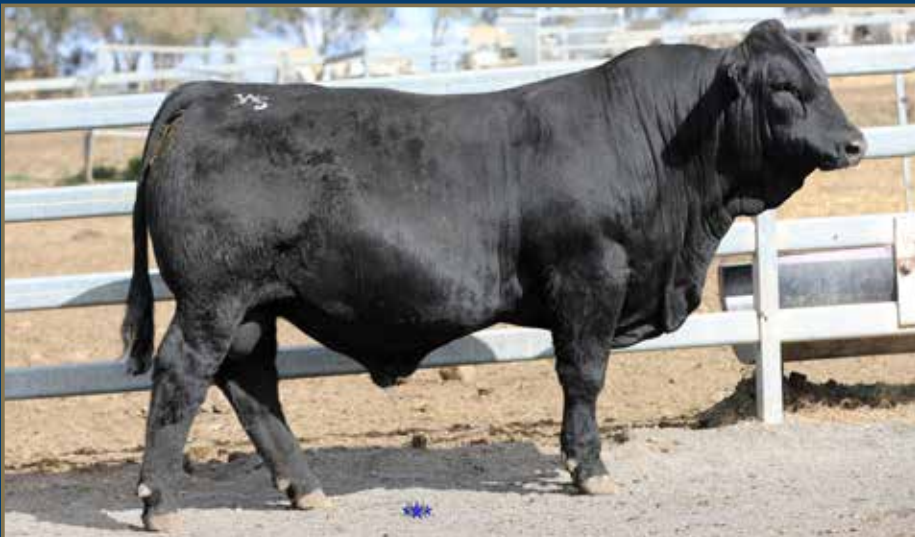
LOT 2 - WOONALLEE RAWHIDE U302