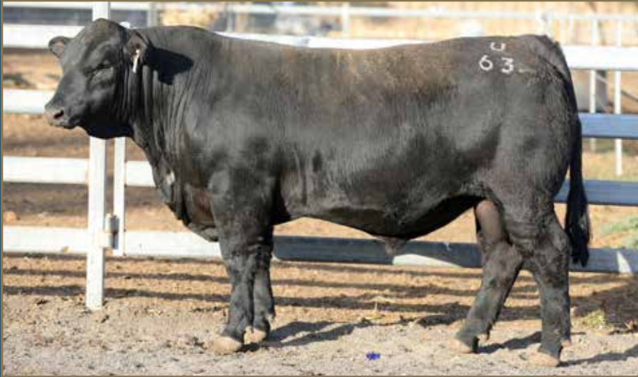
LOT 30 - WOONALLEE REMBRANDT U063