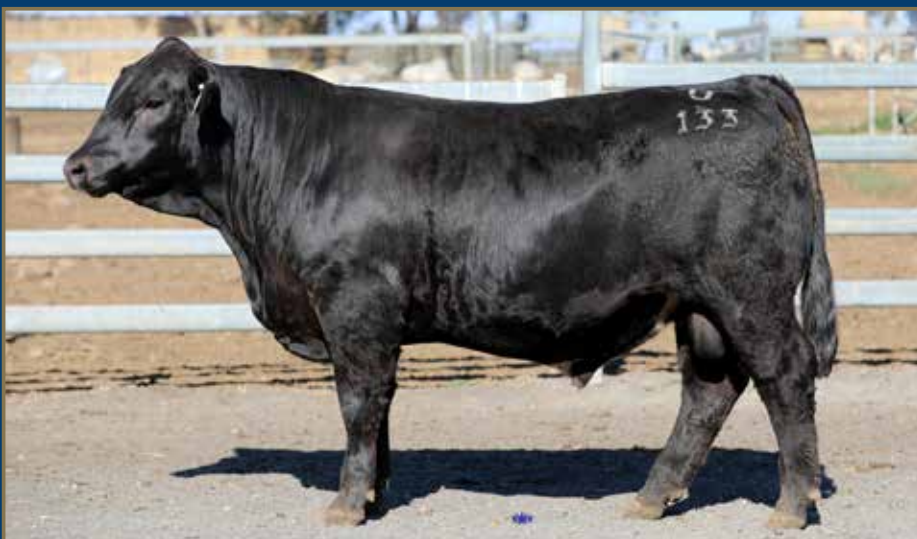
LOT 46 - WOONALLEE MISSLE U133