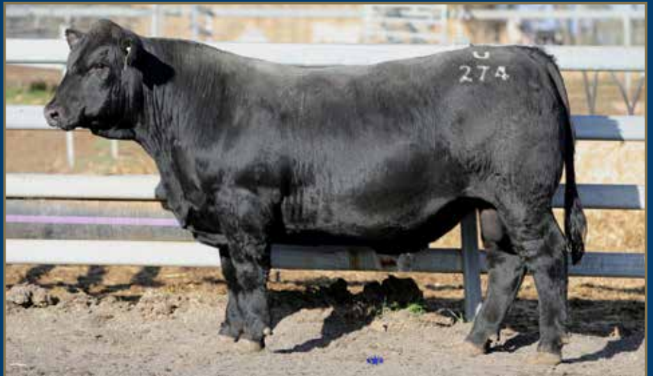
LOT 44 - WOONALLEE NOBEL PRIZE U274