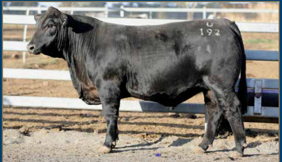
LOT 26 - WOONALLEE CONVERSION U192