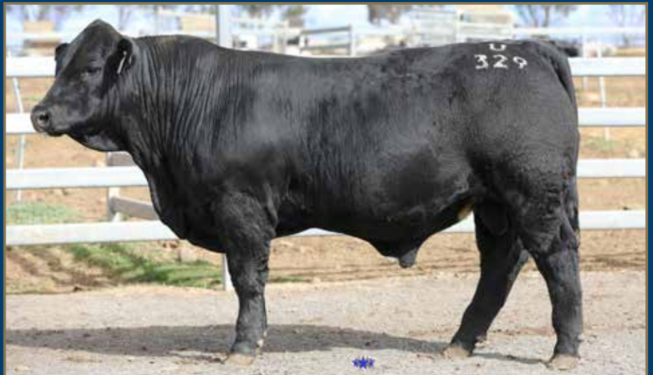
LOT 10 - WOONALLEE RESPECT U329