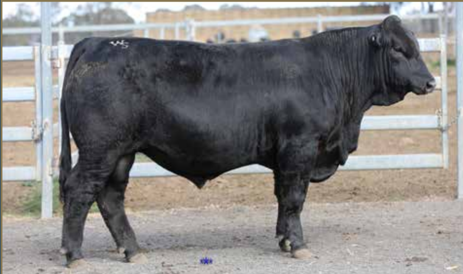
LOT 37 - WOONALLEE HONOR U004