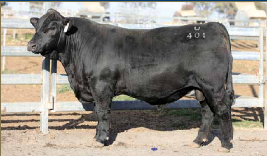
LOT 31 - WOONALLEE CONVERSION U401