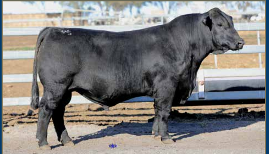
LOT 15 - WOONALLEE HONOR T623