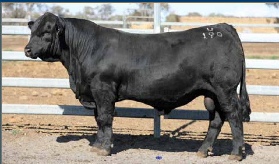
LOT 7 - WOONALLEE WALK THIS WAY U190