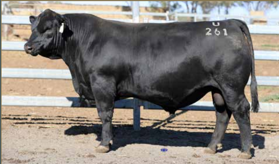
LOT 32 - WOONALLEE REMBRANDT U261