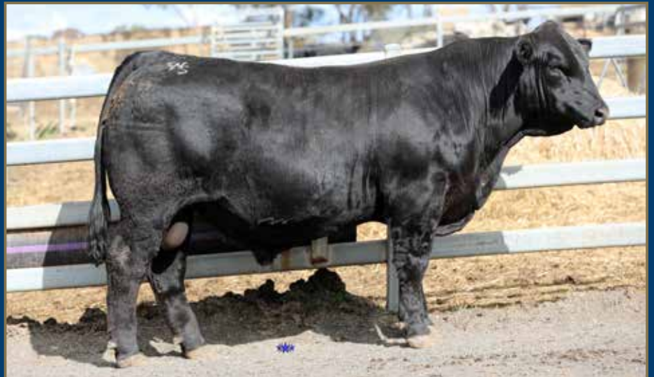
LOT 8 - WOONALLEE GENSIS U116