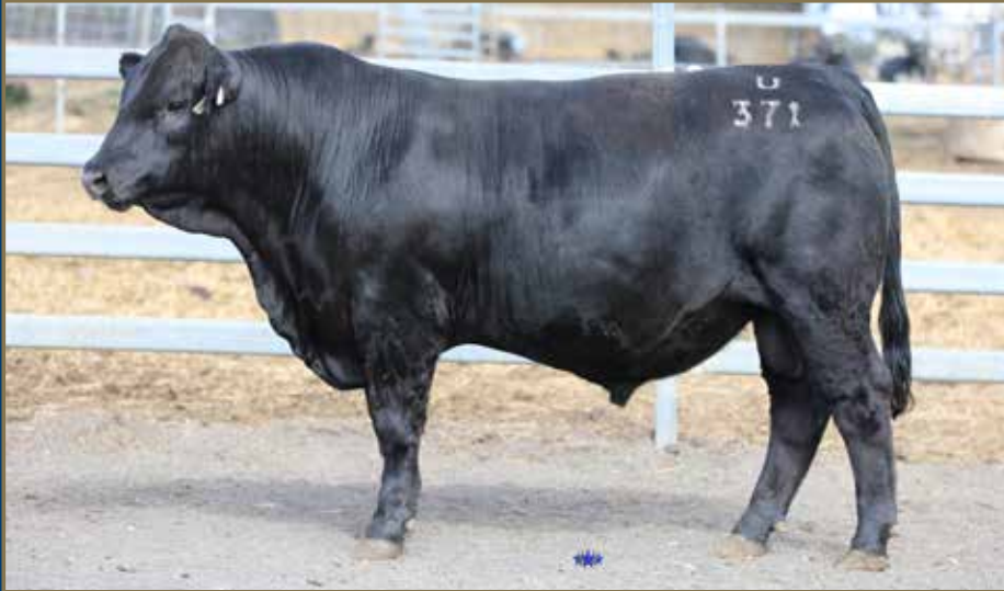
LOT 1 - WOONALLEE AUGUSTUS U371