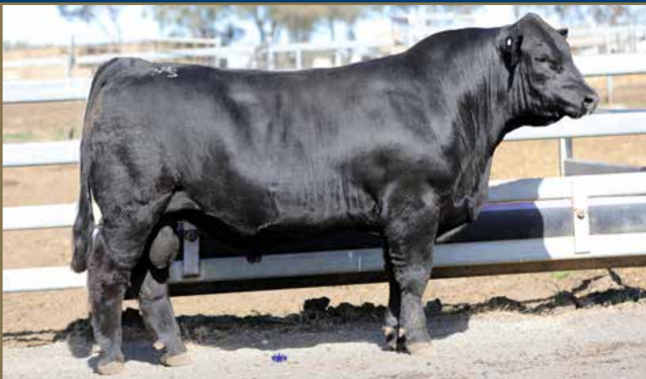
LOT 17 - WOONALLEE NUKARA T680