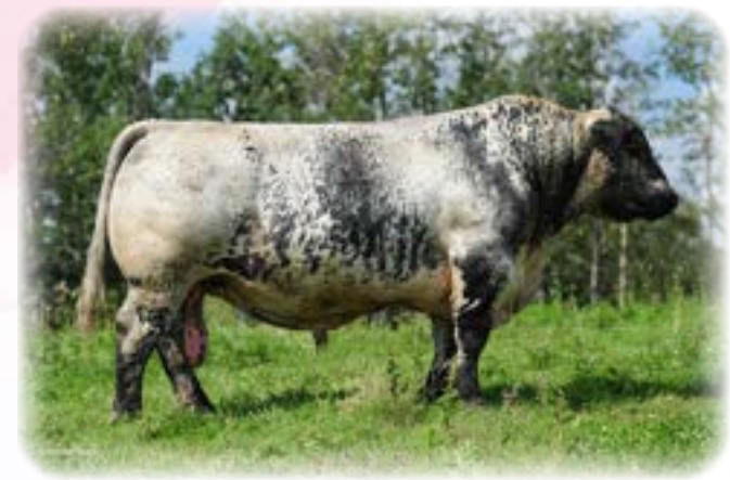
UPTO SPECS ULYSSES 25U