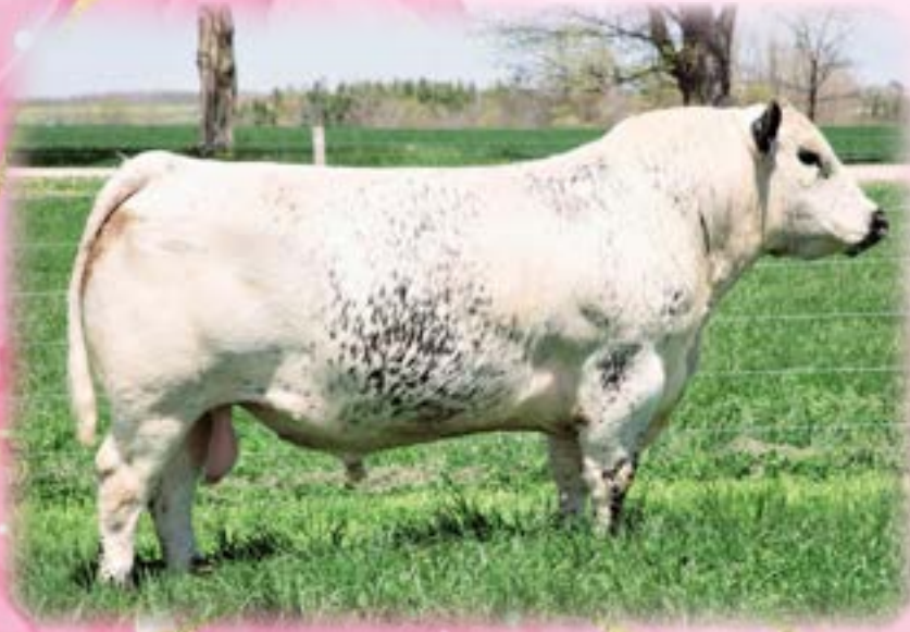
SPLASH OF BLACK GOTCHA 7G