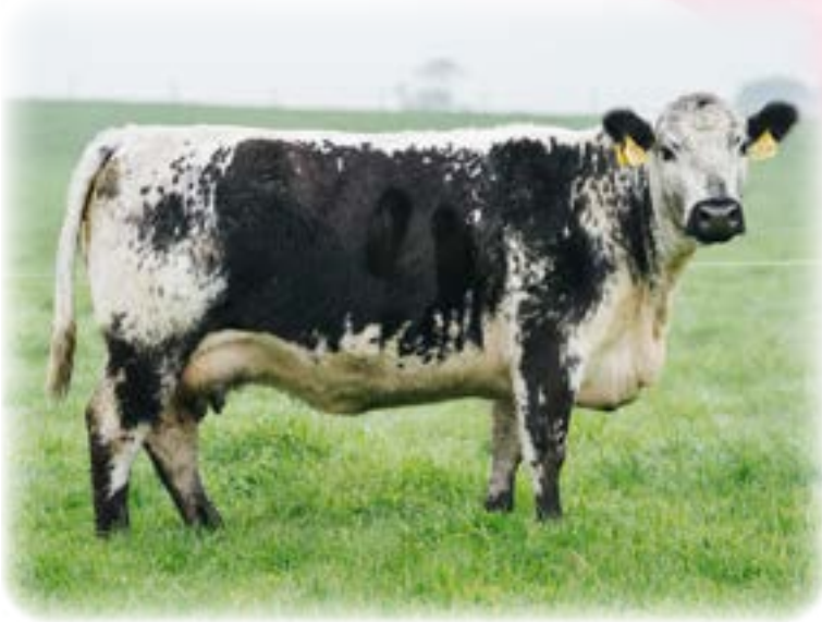
WARATAH WARATAH E25 AMY J196