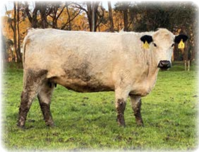
WARATAH ROSE Q7