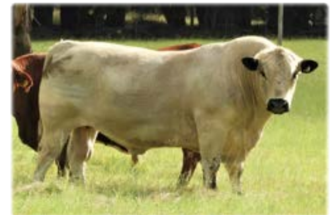
MT ECCLES LED ZEPPELIN