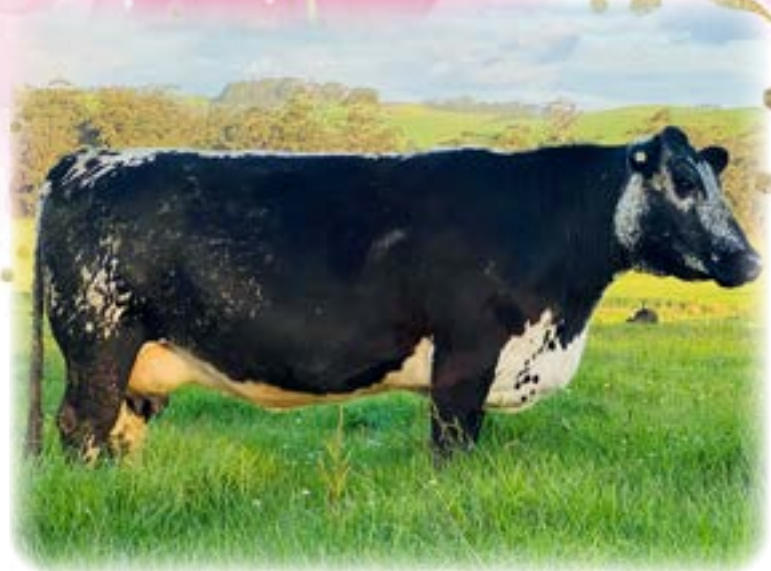
JAD 58Y MISS SAGE P41