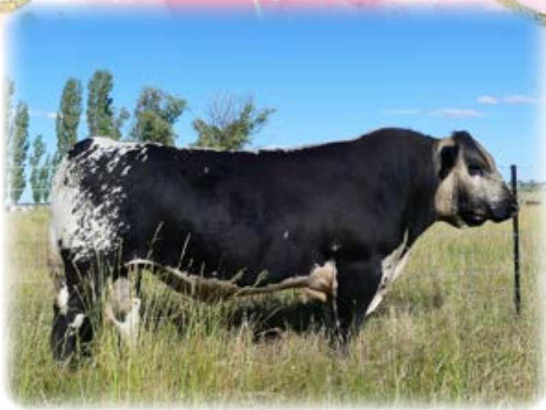
DEEARGEE NEW FONTIER