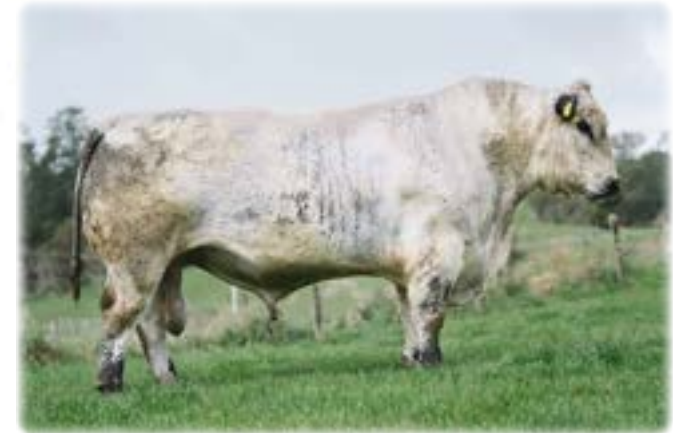
PREMIER 101Y LOGIC L11