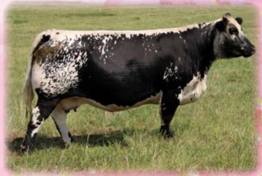
DOUBLE S BELVA 154B