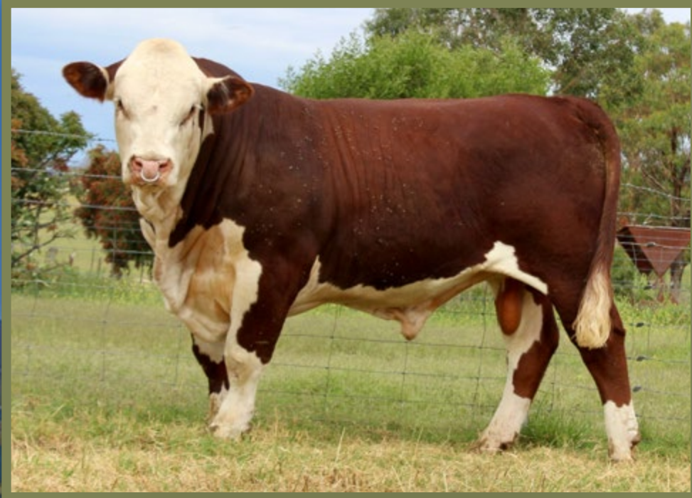
LLANDILLO TIMBER T049