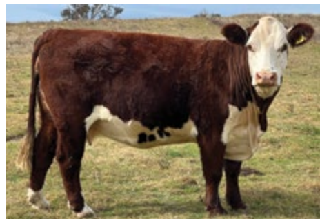
DAM: LLANDILLO CORRISANDE P019