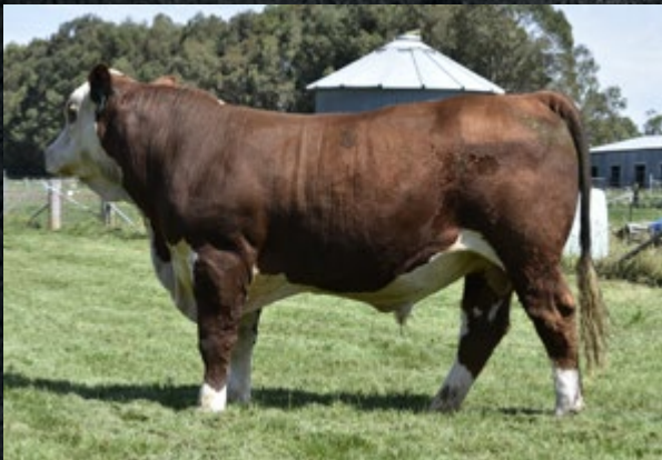
JTR TEXAS T043 (AI) (PP)