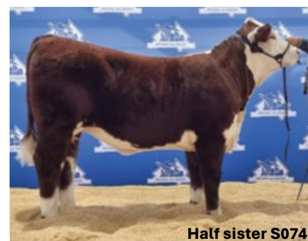
Half sister S074