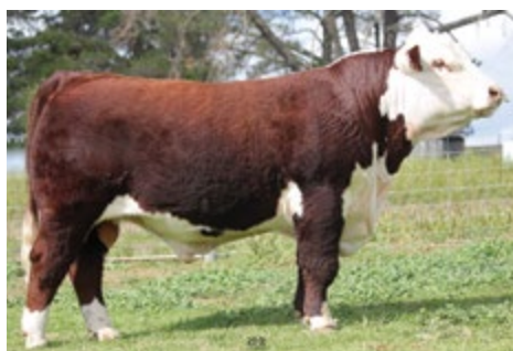
SIRE: GRATHLYN PACEMAKER