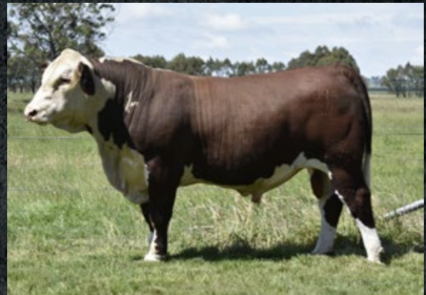
JTR TRIUMPH T049 (AI) (ET) (PP)

FEATURING SONS OF MAILDABURRA JARRAH J2 R LEADER 6964 KOANUI TECHNO 3062 GRANITE HILLS ROCKS R016