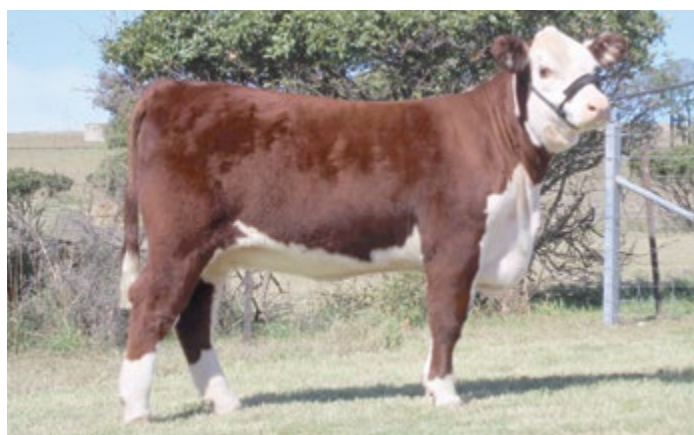
DAUGHTER OF LANN036