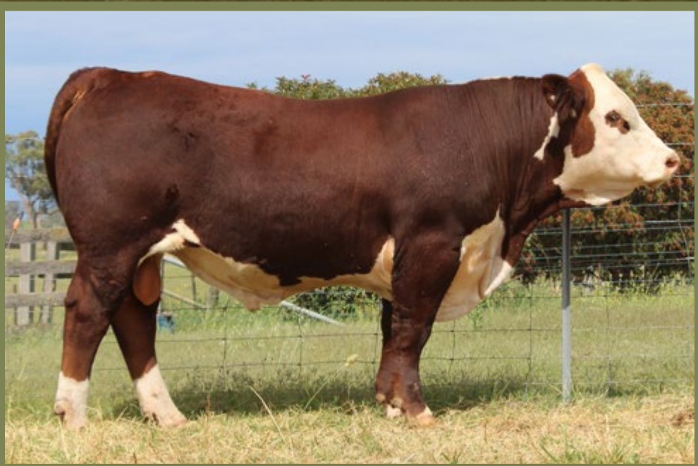
LLANDILLO TORNADO T148