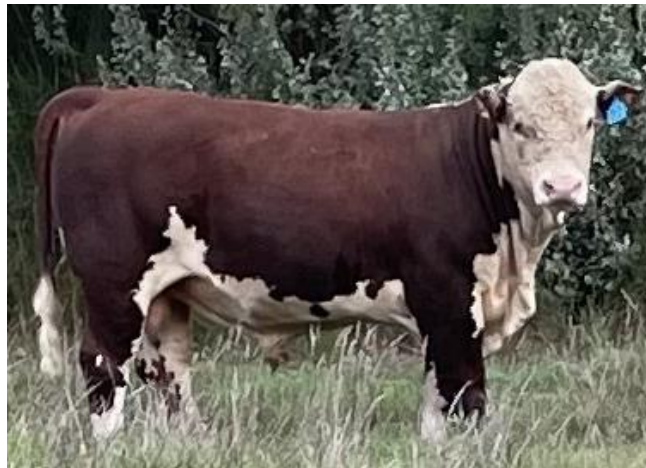
Lot 22 – Glenholme Titan