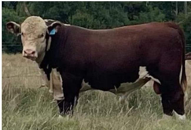
Lot 16 – Glenholme Todd