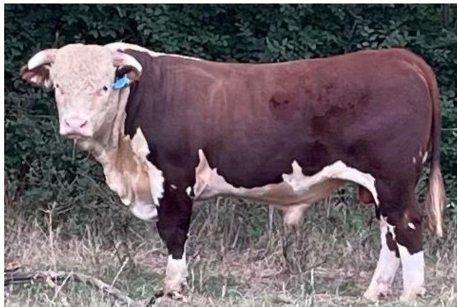
Lot 12 – Glenholme Tierney