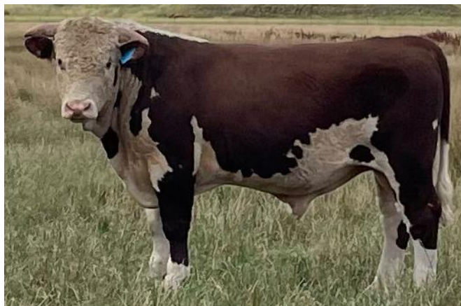
Lot 15 – Glenholme Tate