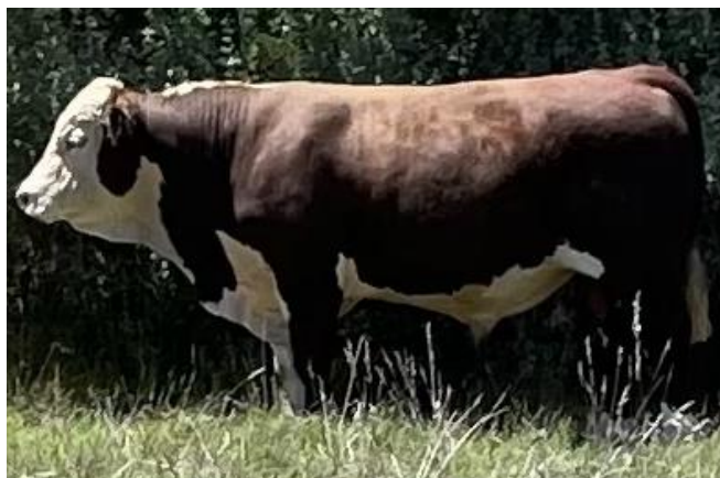
Lot 17 – Glenholme Tony