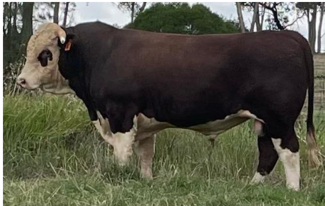
Lot 6 – Kirraweena Terence