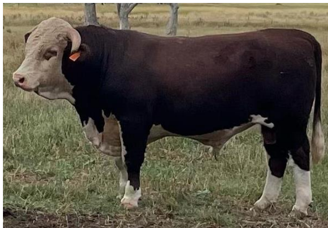
Lot 10 – Kirraweena Taylor T222