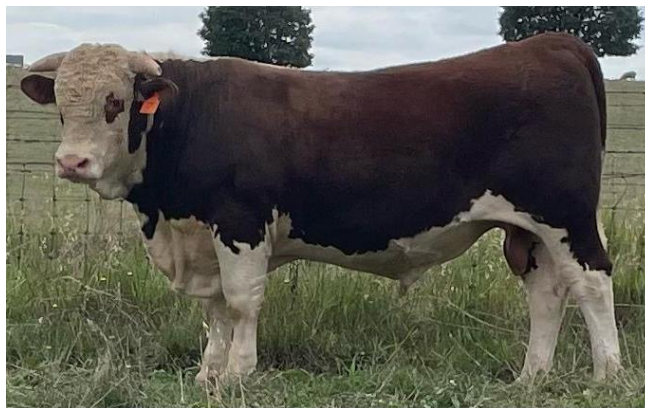
Lot 7 – Kirraweena Trent