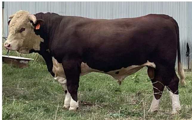
Lot 5 – Kirraweena Toby