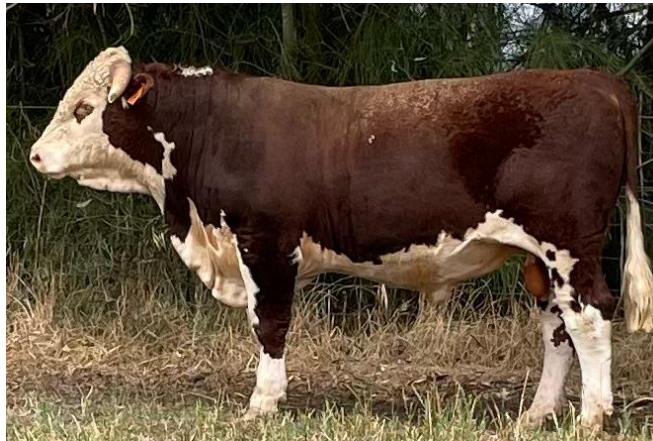
Lot 14 – Kirraweena Theodore