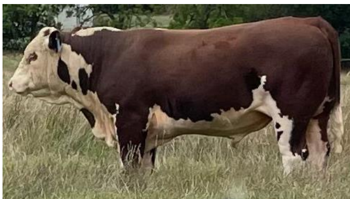
Lot 21 – Glenholme Tenterfield