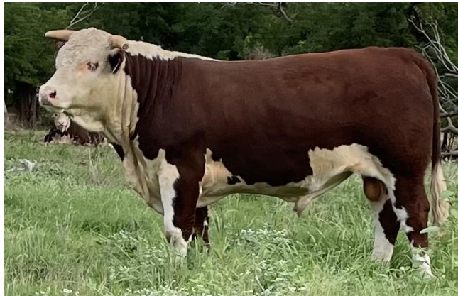
Lot 26 – Glenholme Trevor