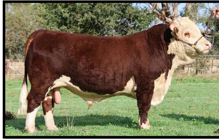
Kirraweena Silver Fern AI (H) (Sire: Pute Nascar) Sold Wodonga 2023 for $24,000 to Tondara Herefords

CONSISTENTLY BREEDING QUALITY, EASY DOING, QUIET HEREFORDS SINCE 1953