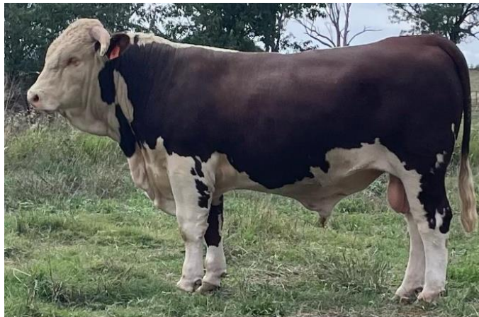
Lot 4 – Kirraweena Thor