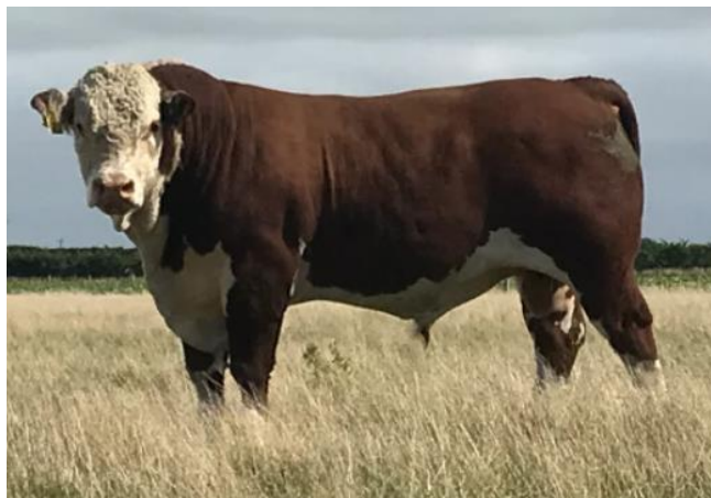
Pute Nascar N13 (H) AI Sire. Semen imported from New Zealand