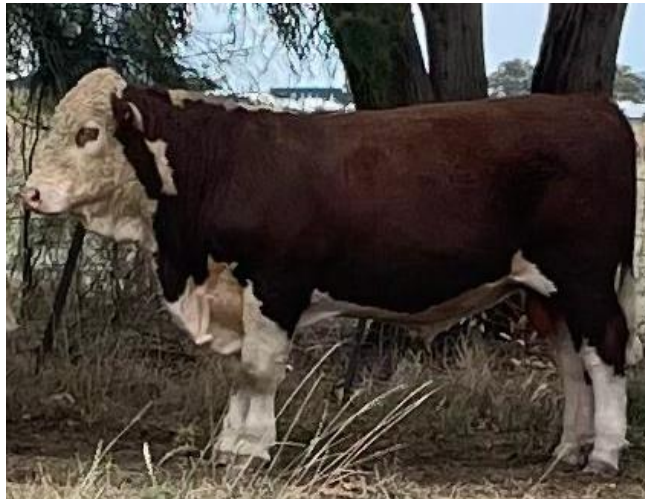
Lot 18 – Glenholme Thatcher