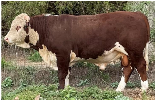
Lot 25 – Glenholme Taree