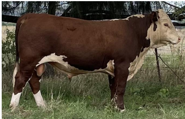
Lot 23 – Glenholme Temora